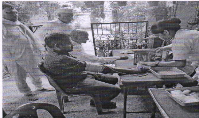
Nagpur Maharashtra India 38°C 100°F 2022-04-23(Sat) 12:17(pm)