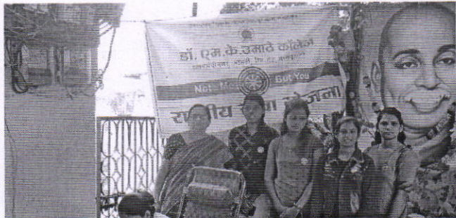
Nagpur Maharashtra India 38°C 100°F 2022-04-23(Sat) 11:37(am)