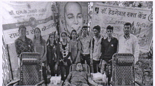
Nagpur Maharashtra India 38°C 100°F 2022-04-23(Sat) 11:47(am)