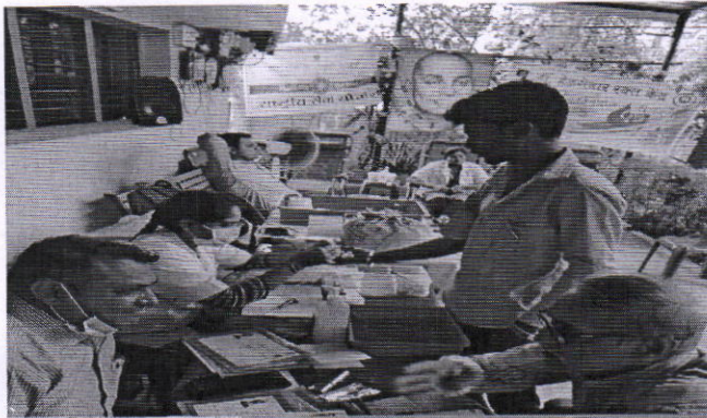
Nagpur Maharashtra India 38°C 100°F 2022-04-23(Sat) 12:07(pm)