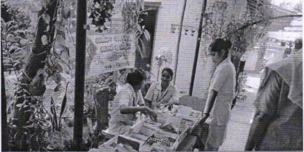
Nagpur Maharashtra India 38°C 100°F 2022-04-23(Sat) 11:58(am)